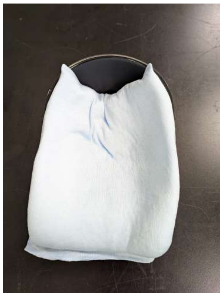
Headrest and Moldcare (HN E, 20cm x 34cm)